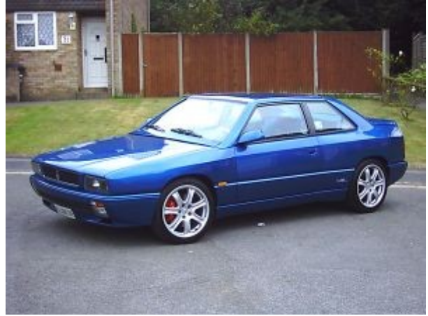
Exterior in Blu Mare.