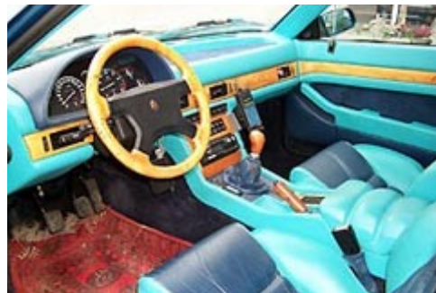
Unique, beautiful & colorful interior.