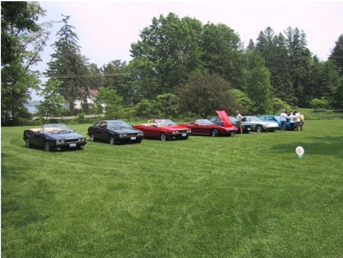
Lake Simcoe: The Briars - Front Lawn

Ontario Maserati Biturbos '85 - '90 et al.